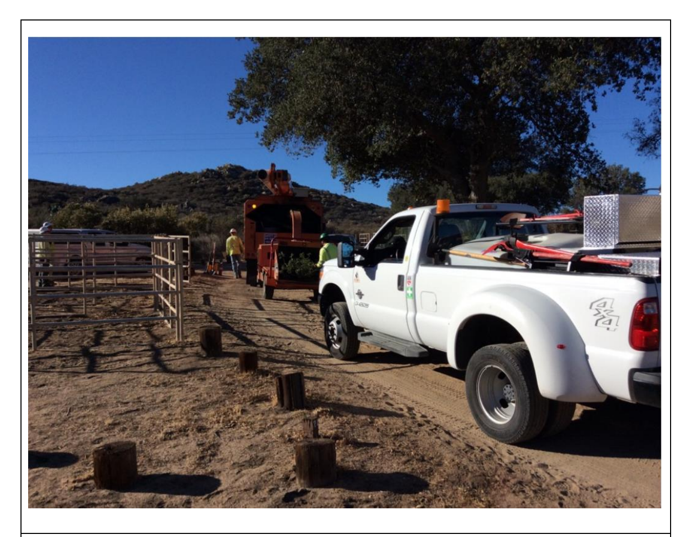
Photo 2: A Fire Patrol remained with the UTS tree trimming crew along the Access Road between Poles Z100048-Z100049 (TL 629C) to ensure the crew was equipped with at least 100 gallons of water with pump and hose during chipping, as required by the CFPPP Fire Matrix (MM FF-1) for the day's fire conditions (PAL D on CNF land).