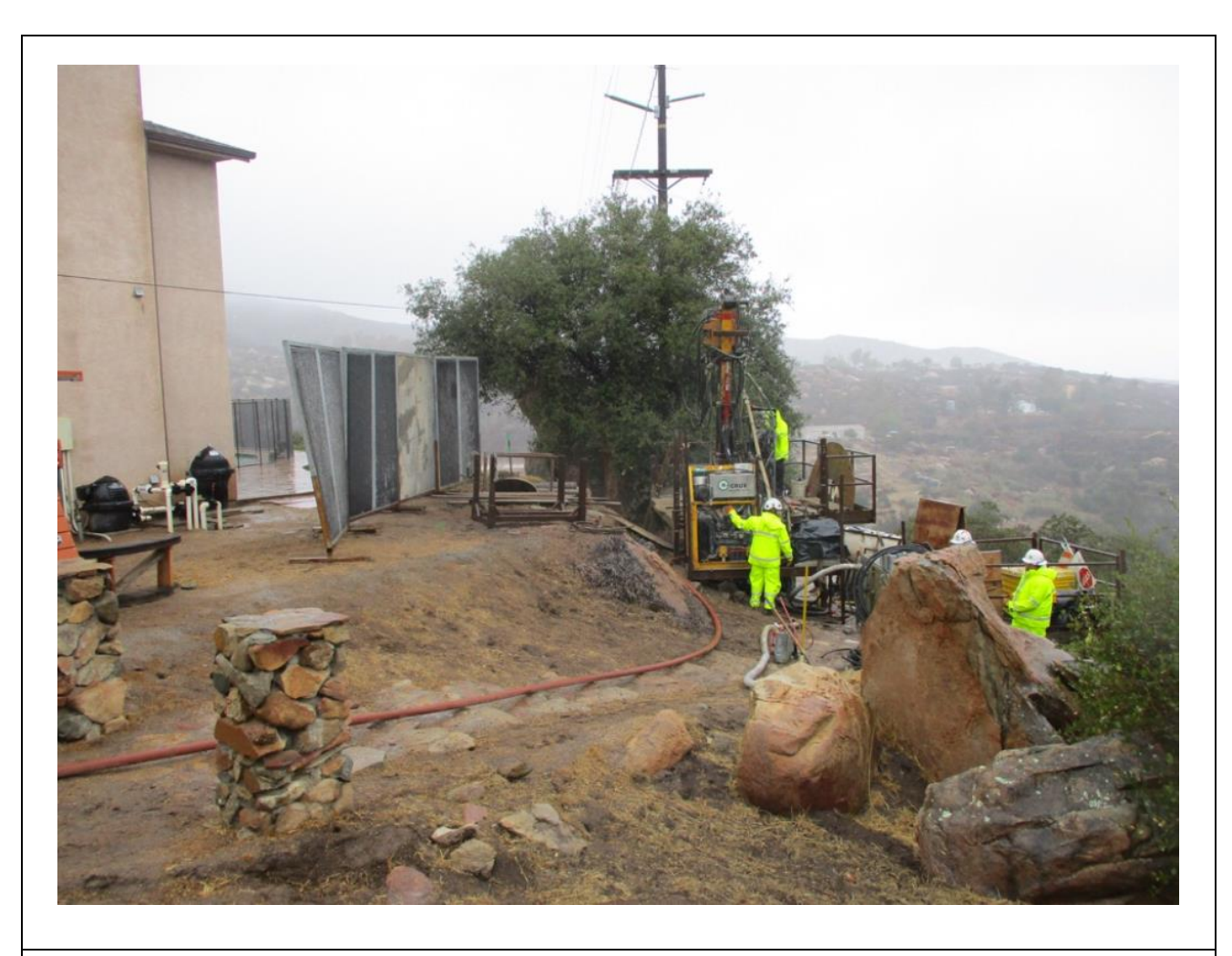
Photo 5: A noise barrier was observed being utilized at Z571469 (TL 6957) in accordance with MM NOI-1 and equipment was observed positioned as far away from the house as possible in accordance with APM NOI-02.