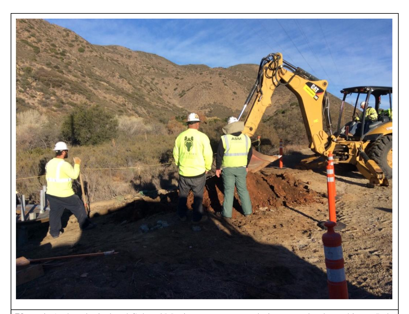
Photo 1: Archaeological and Cultural Monitors were present during ground rod trenching at Pole Z40515 (TL629C) in accordance with the HPMP, APM CUL-04, and MM CUL-1. In addition, crew members were observed adhering to ESA fencing in accordance with the HPMP and APM CUL-03.