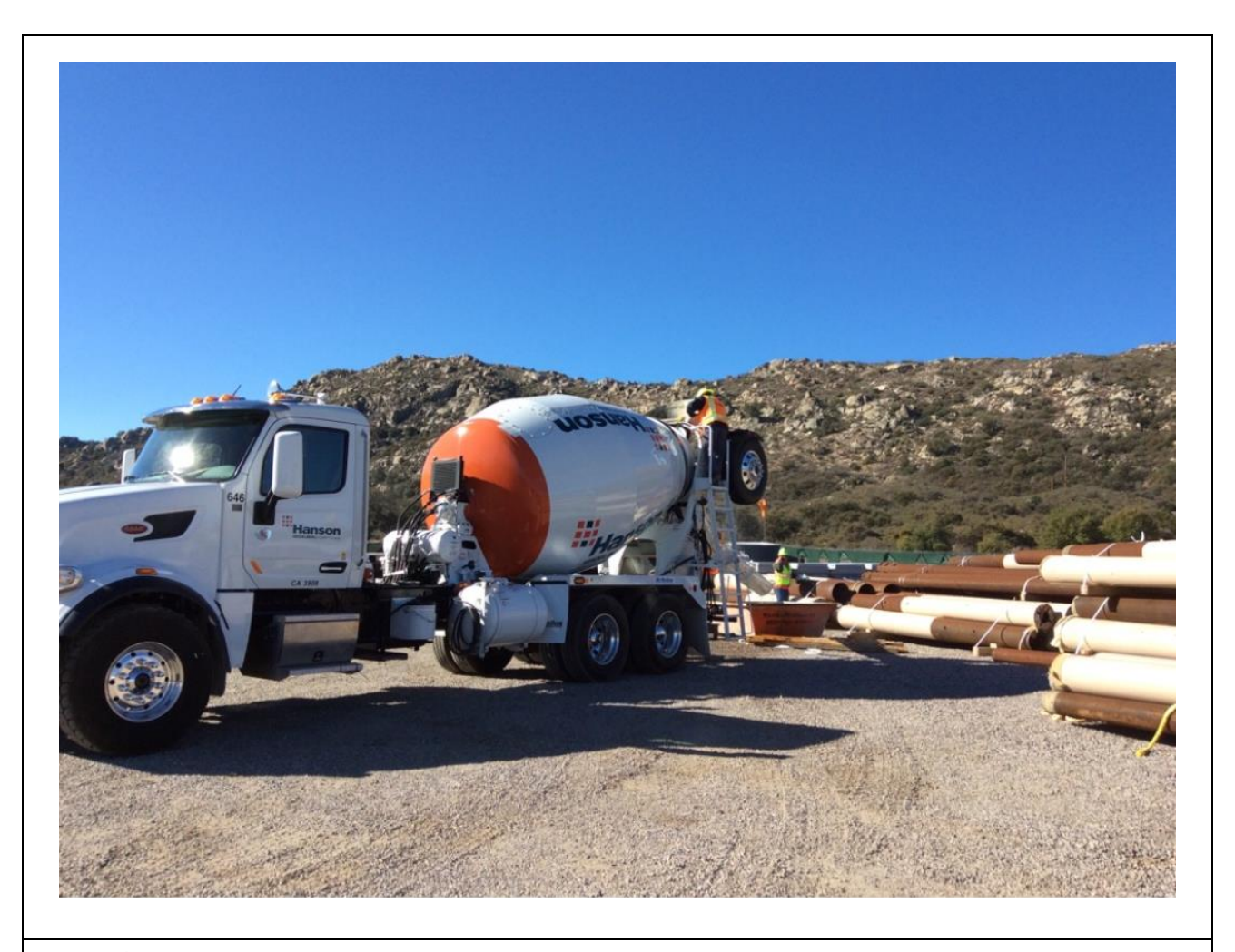
Photo 4: In accordance with APM HYD-01, concrete washout was observed to be taking place at a designated concrete washout station at Kitchen Creek Staging Yard.