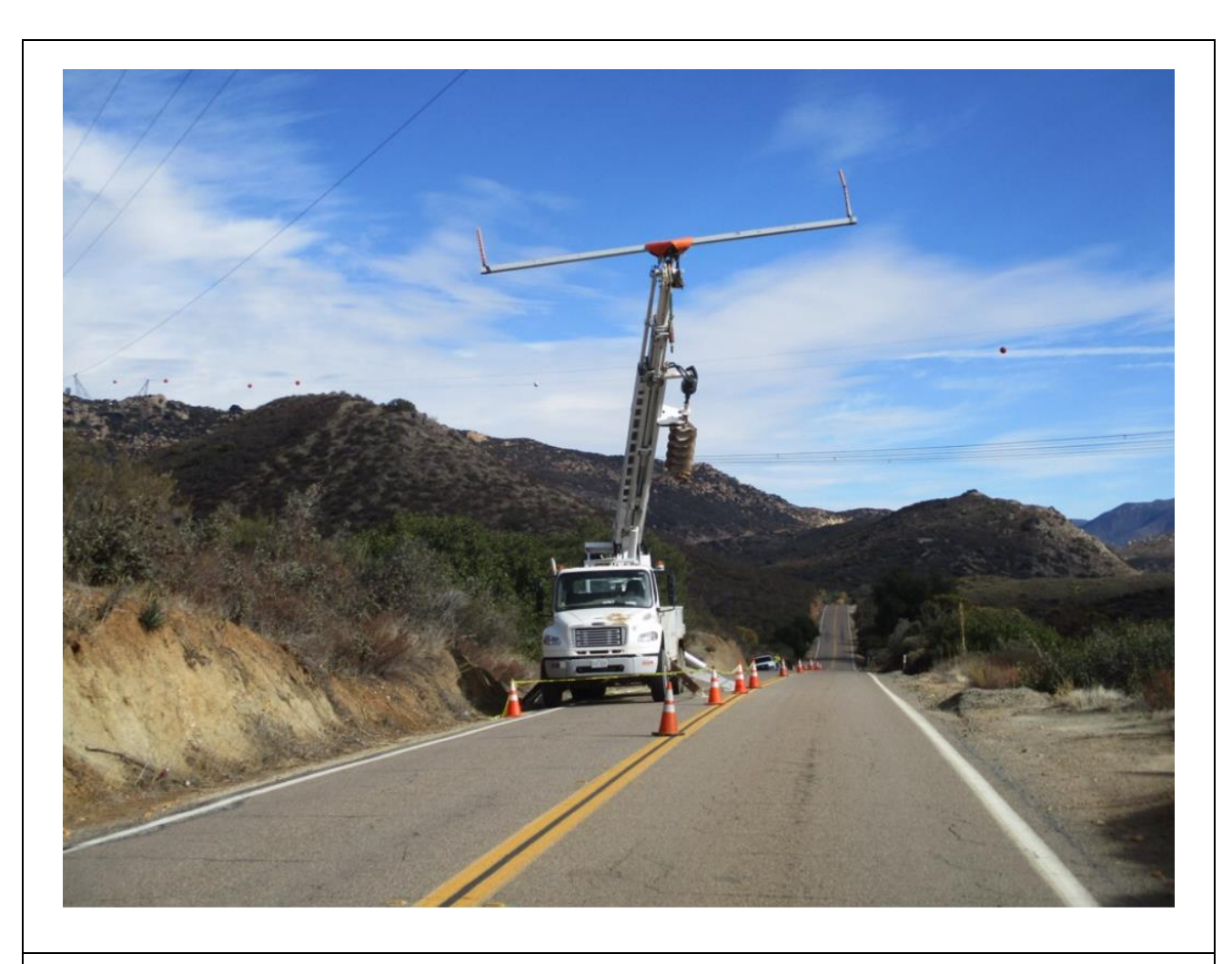
Photo 6: In accordance with APM TRANS-02, Pro Traffic flaggers closed one lane of Lyons Valley Road to allow the staging of a PAR guard structure during fiber optic stringing between Z571432 and Z571451 (TL 6957).